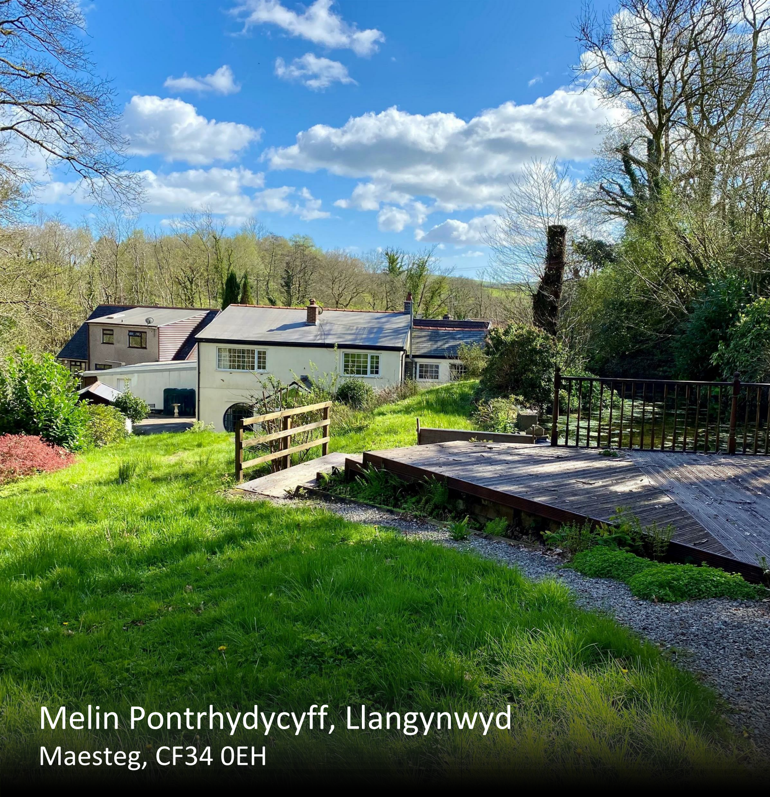
Melin Pontrhydycyff, Llangynwyd Maesteg, CF34 0EH